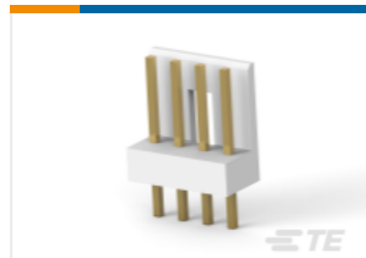
TE Part # 173081-4 4P EIS POST HDR ASSY