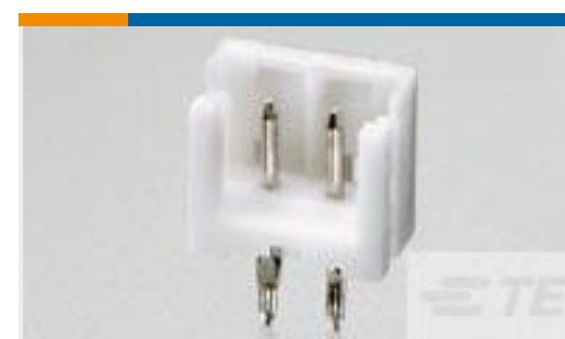
TE Part # 177537-4 2.5 M.I.S POST HDR ASSY 4P