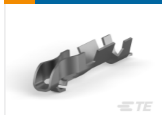
TE Part # 170204-2 EIS CONTACT