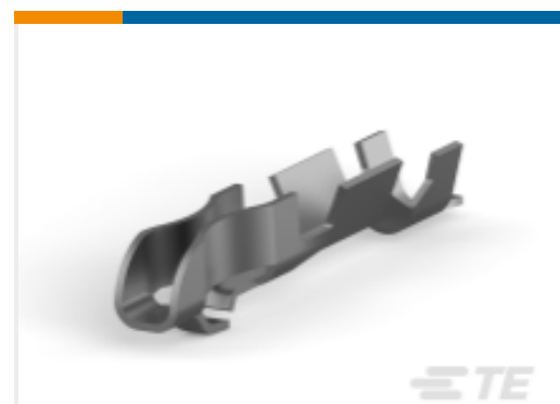
TE Part # 170262-2 EIS CONTACT