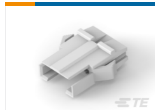
TE Part # 172213-4 EIS CAP HSG PANEL MOUNT 4P NATUTURAL