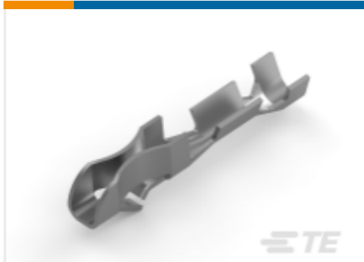
TE Part # 170205-2 E.I. SERIES CONTACT LP