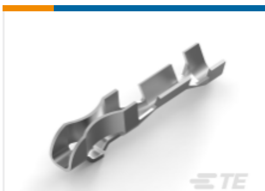
TE Part # 170263-2 E.I.S. CONTACT