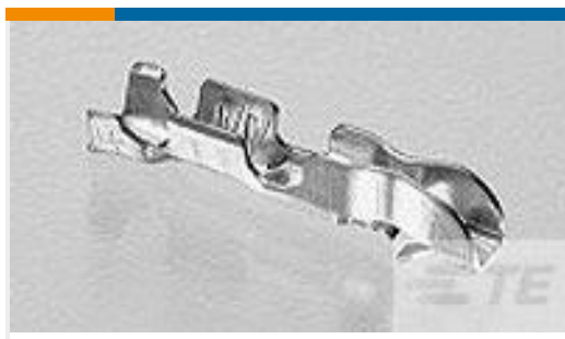
TE Part # 170205-1 E.I. SERIES CONTACT LP