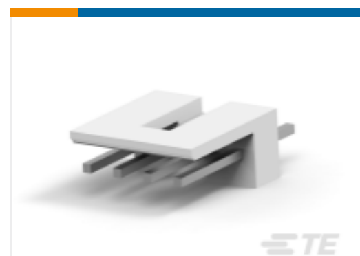
TE Part # 172732-4 POST HEADER 4P EIS WITH KINK