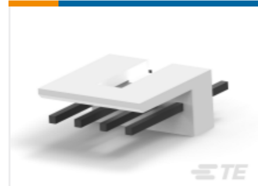
TE Part # 171825-4 TYPE V EIS CONNECTOR 4P ASSY