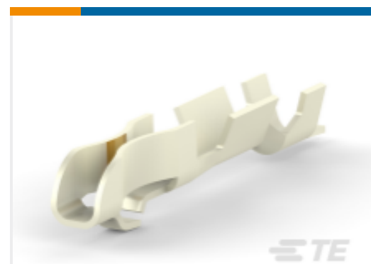
TE Part # 170262-4 EIS CONNCTOR FORMING