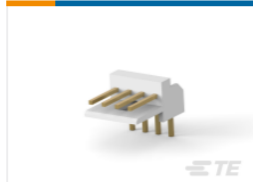
TE Part # 176153-4 EIS POST HDR ASSY H 4P GOLD