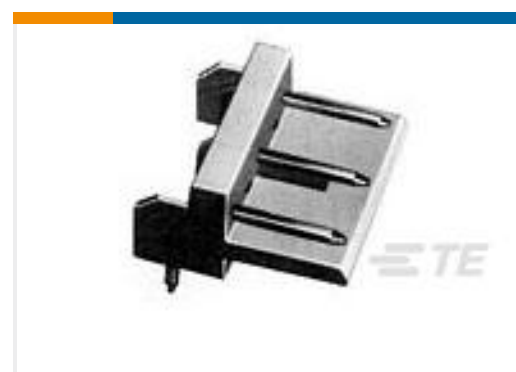
TE Part # 172107-4 H-TYPE E.I.S. CONN. 4P ASSY