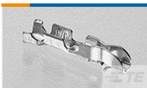
TE Part # 170263-1 EIS CONTACT